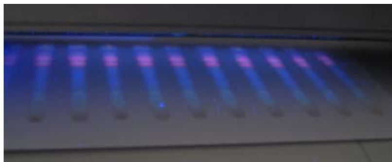
Figure 1. Appearance of TLC plate under 365 nm after separation of methanolic extract of S. cumini seeds on it. Fraction 4 and 5 are visible as red spots.

TLC (thin-layer chromatography) separation: Results of TLC fractionation of ethanol and methanol extracts (Figure 1) of S. cumini seeds are recorded in table-3. They yielded 3 and 7 fractions, respectively. One fraction ( R_f 0.72) was common to both of them. Fraction-7 of methanol extract had R_f value near identical to that of quercetin.