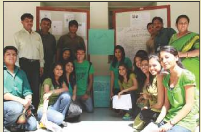
Faculties and students in Green on the Earth Day

The event started with a thought provoking discussion on the Naturalist Theory and its relevance in the present day context. Various events were undertaken to mark this Green day, and these included Collage Competition, Poster Making, T-Shirt Painting, Face Painting, Still Photography, Poetry, Model Making and Slogan Competition. The enthusiasm of the students was reflected in the turnout of the participants from the various semesters. Each exhibit of the event demonstrated how the Mother Earth had been degraded and how each and every one of us can perform our part and move towards a Cleaner, Greener Mother Earth.