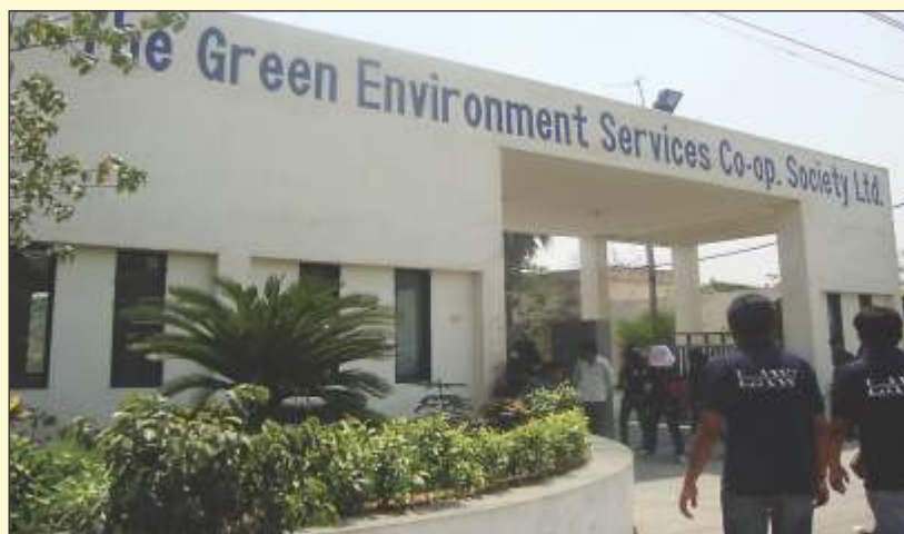
Students on the field visit