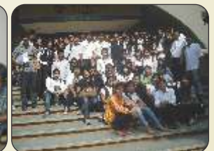
Resource persons with Semester VI students during Mediation Workshop