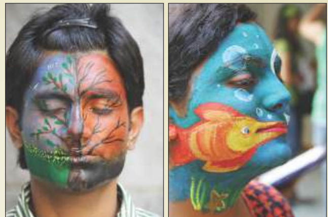
Face Painting Competition during the Earth Day Celebration