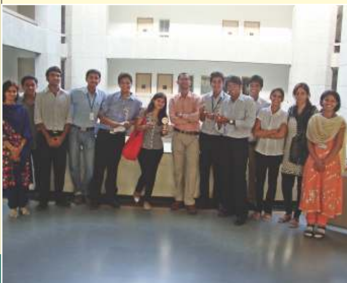
Winners of the Debate Competition with other participants and Faculties

Literary and debate Committee organized a debate competition on 6 th May 2011. The topics offered for presentation were "Legalizing Lok Pal Bill", "Big Brother watching...how justifiable?" & "Sports' men as cattle".