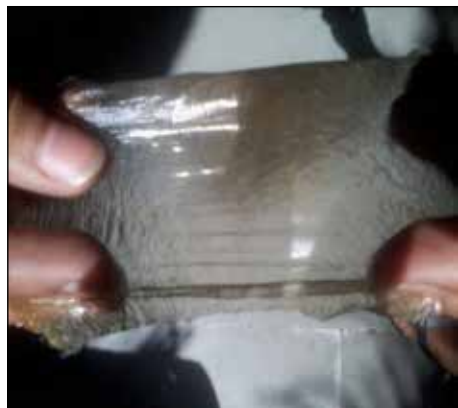
Fig.: 2 Experimental WG films

WG films are prepared by vigorously mixing all components in a homogenizer. The film forming solution is then allowed to settle so as to separate the foam formed (30 min). Films are subsequently spread onto a plexi-glass surface using a thin-layer applicator and dried after a smooth application of paraffin oil to avoid early degradation.