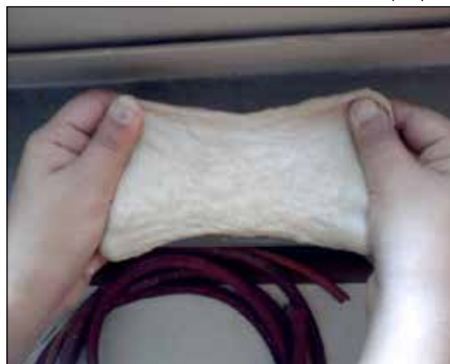
Fig.3: Stretched Gluten demonstrating its cohesive properties.

Partal et al suggests that knowledge of processing effects on the rheological properties of WG based biomaterials is important for the optimization of the productive process and to obtain biomaterials with suitable mechanical properties.[19]