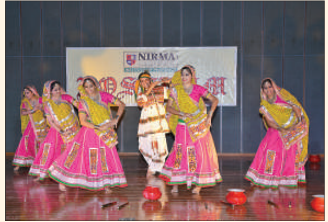
A glimpse of Rostrum at IP-NU