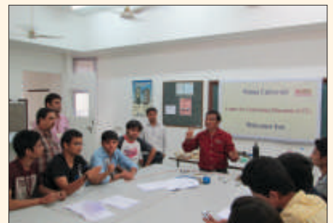
One Day Workshop on Refrigeration Mechanic conducted by IDS-NU on October 31, 2015