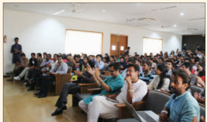
The engaged audience during the poem recitation at IL-NU

The Center for Social Justice, IL-NU organized 'Kalrav'- a Confluence of Kavi Sammelan and Short skits on September 3, 2015. The programme included various inspirational lines recited by the speakers on issues related to gender; the contribution of girls and women in society; the problems being faced by farmers of the country, recent unrest in Ahmedabad' a poetic description of real life situations of prisoners in India; family issues and many more other related issues.