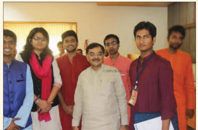
Shri Tarun Vijay with the students at IL-NU

'Pratinidhitva', the First Model Indian Parliament (MIP) was organized at IL-NU on October 2-3, 2015. MIP is a simulation of Indian Parliament and various other committees where students learnt about diplomacy, parliamentary procedure, and political demographics of country. It involved and taught research, public speaking, debating, writing skills in addition to teamwork, critical thinking and leadership ability. Shri Tarun Vijay, Member of Parliament, Rajyasabha, inaugurated the session. Shri Tarun Vijay addressed the participants and discussed about several policy matters in an interactive session. The participants discussed on the issues of national or historical importance to the nation. The event witnessed delegates from across the nation speaking on policy issues, discussing the framework and ultimately leading to youth awareness.