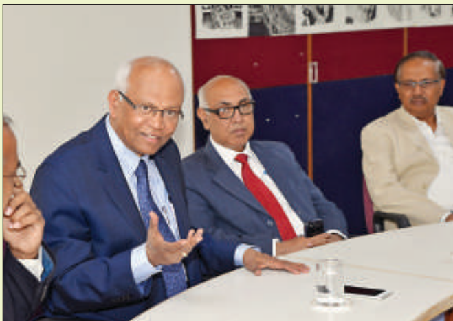
Padmashri, Padmabhusan Dr Raghunath A. Mashelkar, FRS, National Research Professor and President, Global Research Alliance visited NU on December 12, 2015 as the Chief Guest for the Twentieth Convocation.