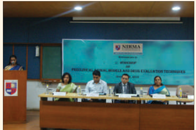
The dignitaries on the dais during the workshop at IP-NU

Research Facilities, Zydus Research Centre was the Chief Guest and delivered the key note address. The workshop was attended by several participants from different parts of Gujarat from medical as well as pharmacy colleges. Surgical models for cardiac hypertrophy, stroke, hypertension, invasive method of measurement of blood pressure, heart rate and hemodynamic parameters were demonstrated. An insight into molecular techniques like Polymerase Chain Reaction (PCR), Enzyme Linked Immunosorbent Assay (ELISA), Gel Electrophoresis etc. was also given.