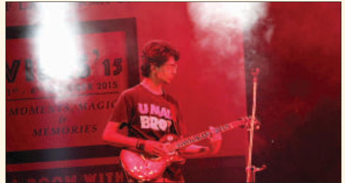
Animated performance by a student during the Cultural and Sports Festival at IL-NU

Flagship Events were Barn Dance, War of Bands, War of DJ's and Fashion Fiesta. Model Indian Parliament 'Pratinidhitva' was also the highlight of the event.