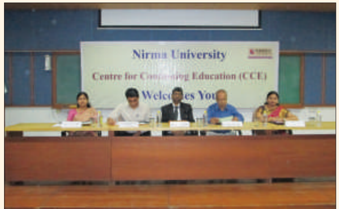
One Day National Seminar on CTD-Technical and Regulatory Requirement conducted by IP-NU on September 26, 2015