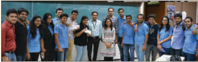
The Winners of 'Deep Pockets' at IM-NU

The Finesse Club of IM-NU organised 'Deep Pockets-Time to Think!' on October 30, 2015. It included Sudoku, puzzles and 'FinCharades' to test the co-ordination among the team members and they had to act on financial terms. The finale was based on the Venture Capitalism. The participants had to come up with a business idea and had to act as a venture capitalist as well.