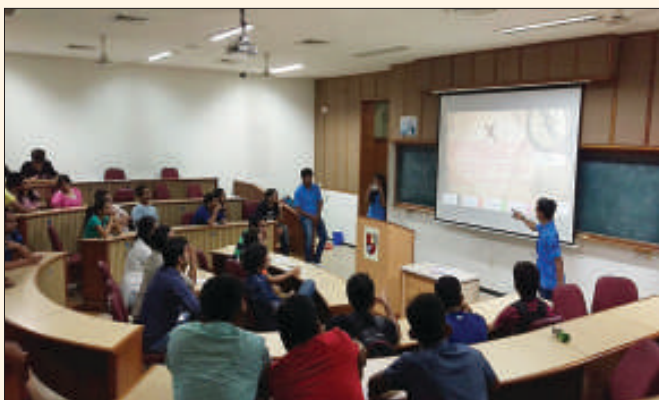
The teams being told the rules at IM-NU

The event 'Tantrums-Time to Outbreak' by Finesse Club IM-NU, was organized on September 30, 2015. Finesse members designed a quiz followed by a Treasure Hunt. The finale was based on the Stock Exchange-Stock Game. In finale, the participants were given previous day stock price and the present day news related to the stock market and were asked to quote the present day closing price of respective stock.