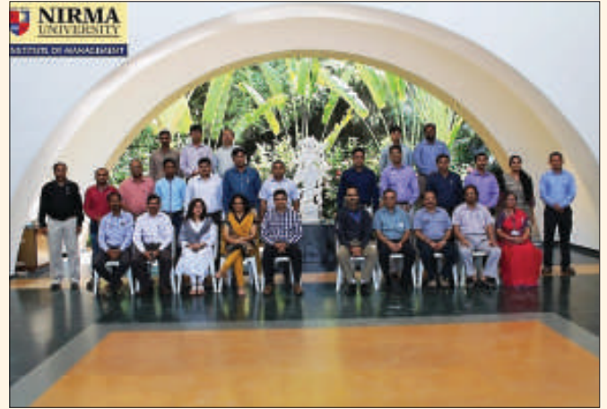
Three Days Management Development Programme (MDP) on Effective Communications for Higher Performance conducted by IM-NU during October 8-10, 2015