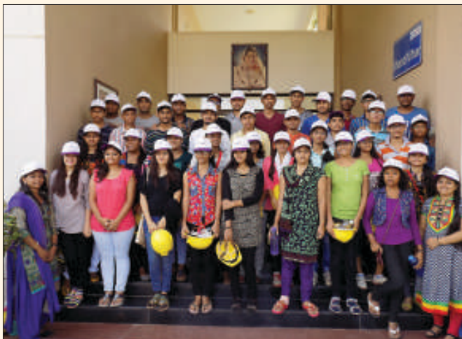
The students of IDS-NU during the visit to the Port

An Educational Visit to exhibition at 'Ahmedabad Machine Tool EXPO' at Mahatma Mandir Gandhinagar was organized for the students of IDS-NU on September 24, 2015. In addition another educational visit to Adani Port Mudra, was also organized for the students of IDS-NU during October 8-9, 2015.