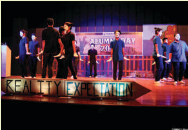
The students of IM-NU performing during the Alumni Day Celebration at IM-NU

IM-NU celebrated the Alumni Day on October 3, 2015. Almost 200 alumni along with their family members attended the nostalgic reunion. The activities of the day included a musical night, a friendly match of football between the students and the alumni, a visit to the stall where the crafts prepared by the children as a part of Saral, the on-campus NGO were displayed and a stroll around the campus till late in the night to re-live the memories of their days at the Institute. At night, alumni were invited to lodge in the hostels for the night and re-live their fondest memories in their own old hostel rooms.