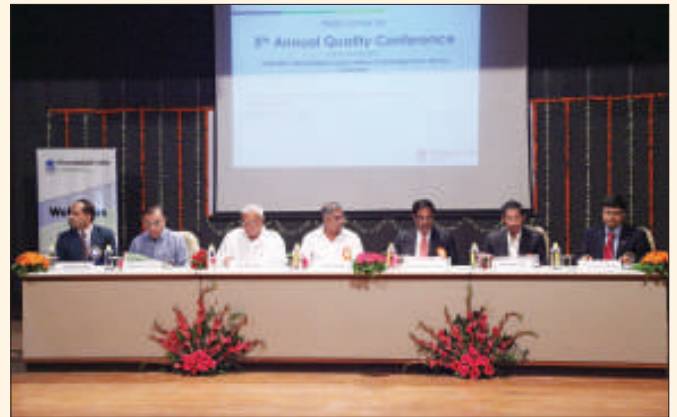
Inaugural programme of the Fifth Annual Quality Conference at IM-NU