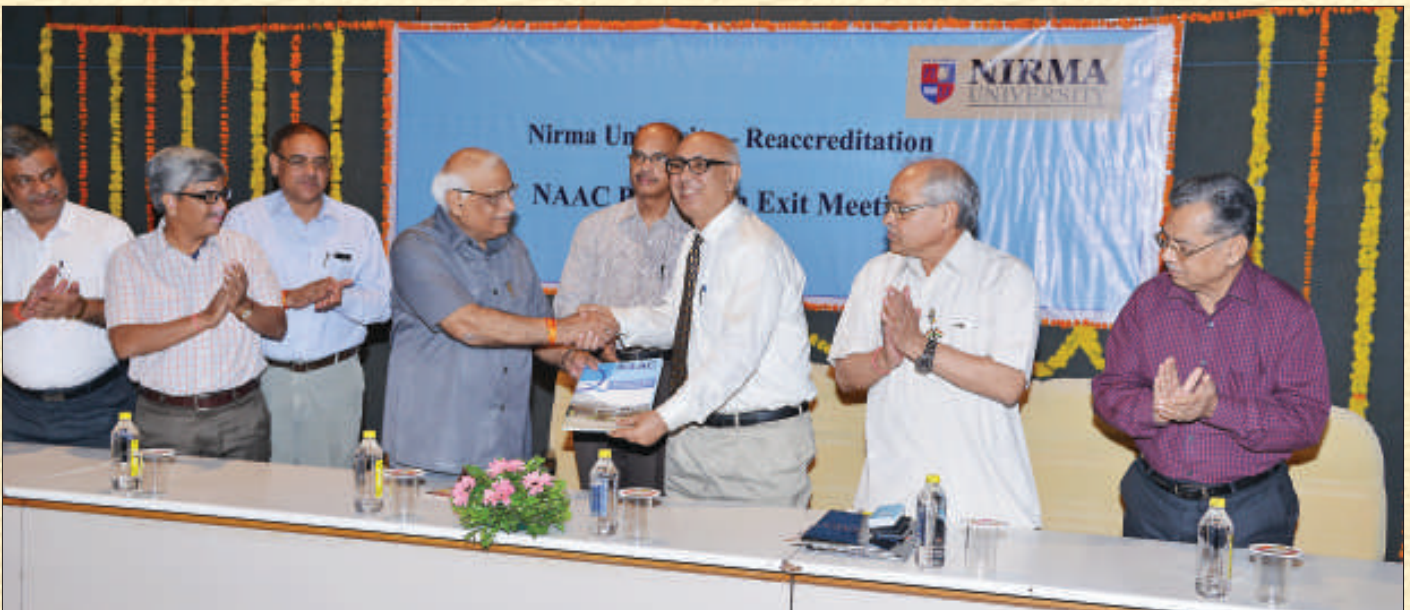
The Chairman of the NAAC Peer Team handing over the report to the Director General of the University

Nirma University has been accredited by National Assessment and Accreditation Council (NAAC) with 'A' Grade (in Cycle 2). The University has been accredited with a CGPA of 3.18 on a four point scale and has been awarded the highest 'A' Grade. This is the highest CGPA in the state of Gujarat as far as the statutory universities are concerned. In terms of grade 'A', Nirma University is the only Private State University in the State of Gujarat to achieve this feat.