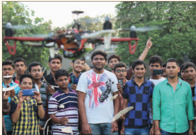
The Multicopter taking a ride during i-fest at IT-NU