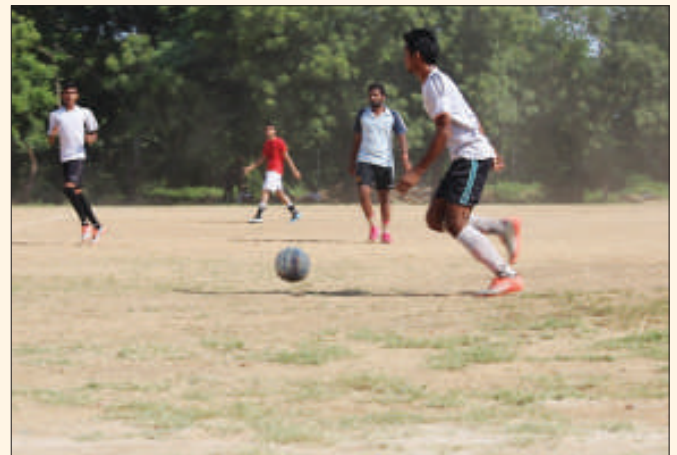
Football Match during i-fest at IT-NU

ISTE Student's Chapter of IT-NU organized a football championship during its annual festival, iFest '15