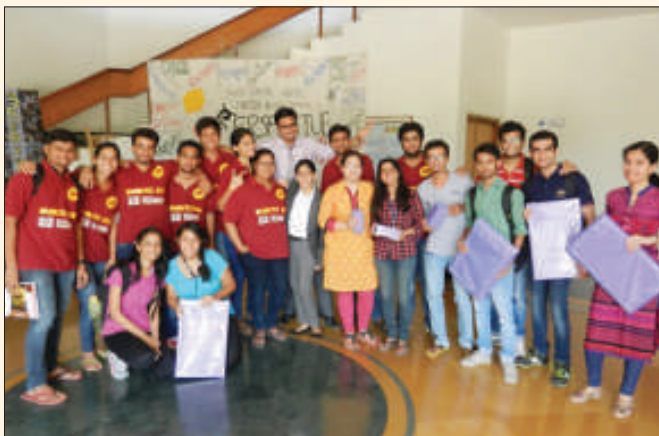
The participants of 'Finding Funny' at IM-NU

Finding Funny was a 'fun' event organised by Chehre, the dramatics club of IM-NU on October 26 and 27, 2015. Each team had to coordinate with their respective counterparts in the girls/boys hostels. It included a treasure hunt and many activities related to movies and TV shows. It sought to test the participants' knowledge of the same. The participants were also asked to enact spoofs of videos clips from famous movies on the spot.