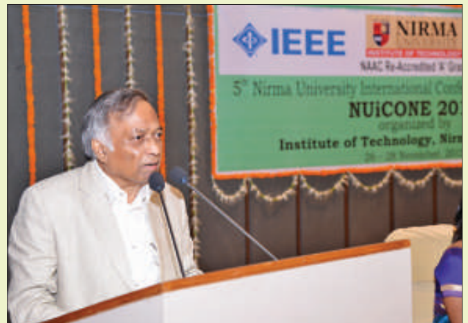
Padmashri, Padmabhusan Dr Vijay Bhatkar, acclaimed Scientist and IT Leader and a member of Scientific Advisory Committee to the PM of India, graced the inaugural programme of the Fifth Nirma University International Conference on Engineering (NUiCONE) as the Chief Guest on November 26, 2015 at IT-NU.