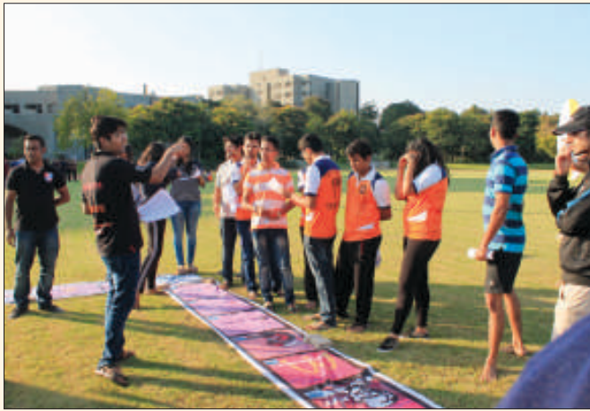
'Monopoly' in progress at IM-NU