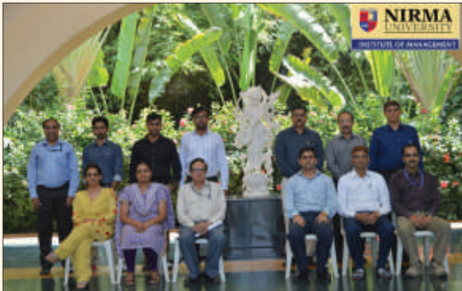
Three Days Management Development Programme (MDP) on Developing HR Proficiencies - A Workshop for HR Executive conducted by IM-NU during September 10-12, 2015