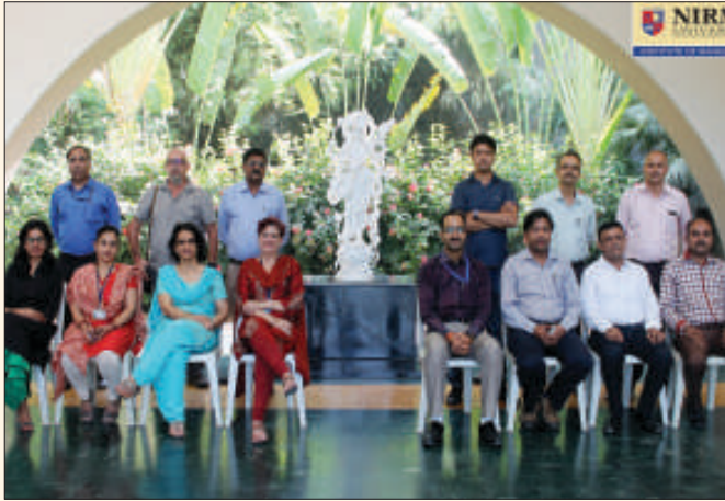
Three Days Management Development Programme (MDP) on Managerial Skill for Supervisory Personnel conducted by IM-NU during October 5-7, 2015