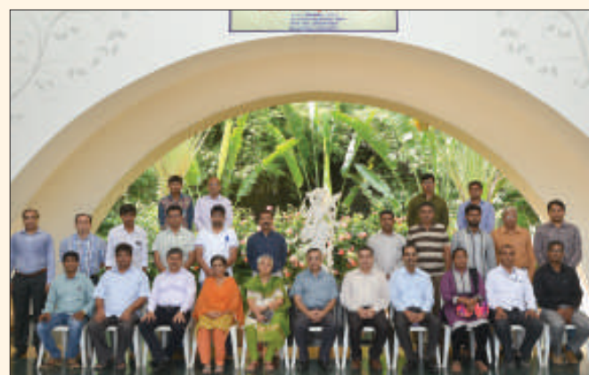
The participants of the Total Dealership Management Programme at IM-NU

The third batch of two days 'Total Dealership Management' programme was organised by IM-NU for the dealers of Indian Oil Corporation Ltd. during September 15-16, 2015. These dealers represented different urban and rural areas of Gujarat State. The programme covered topics as CRM, Self-Development, Team-Building, Brand Management, Sales Management, People Management and Profitability Analysis.