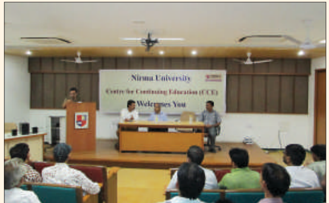
Three Days Training Programme on Defensive Driving conducted by CCE during September 12, 19, 26, 2015