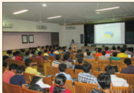
Six Days Workshop on 3D CAD Solid Modeling using Software conducted by IT-NU during October 19-24, 2015