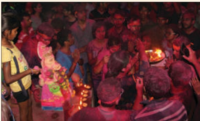
The visarjan procession of the Ganapati Idol at IM-NU

The auspicious festival of Ganesh Chaturthi was celebrated amidst unmatched fervour by the students of IM-NU. The Cultural Committee of the Institute made huge efforts in the midst of the exams to make everything superior. The Ganapati idol arrived in the campus on September 17 and the Visarjan, on September 23, 2015 saw a huge crowd of enthused youngsters.