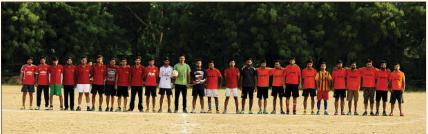
The football teams ready to rumble

The inter class Football Tournament for MBA students was conducted at IM-NU during September 1-4, 2015. The event saw participation of more than 150 students. The matches were played early in the morning from 6.00 am to 8.30 am and in the evening from 6.00 pm to 7.00 pm.