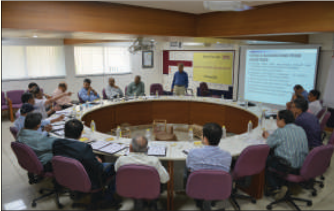
The Industrial Meet in progress at the University

The meet turned out to be really successful as various agreements were reached upon, to initiate interface and collaboration amongst the participating industries and the University.