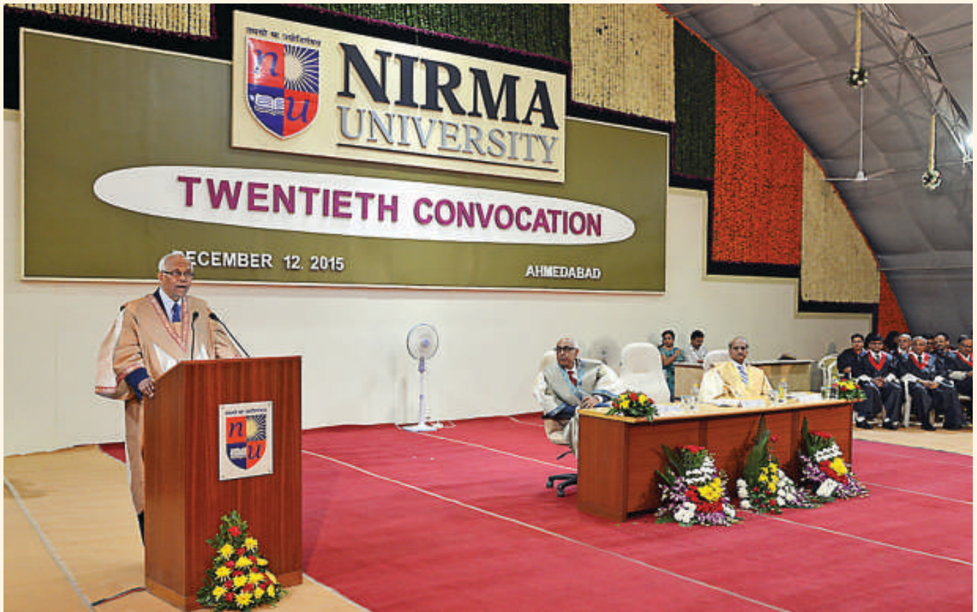
Dr Raghunath A. Mashelkar addressing the audience during the Convocation

The Twentieth Convocation of the University was held on December 12, 2015. Dr Raghunath A. Mashelkar, FRS, National Research Professor and President, Global Research Alliance was the Chief Guest for the occasion. Dr Mashelkar delivered the convocation address and also presented scholastic medals to the students of the University. In his motivational address he talked about the 'Nirma Spirit'; He pondered upon the value for money; striving for ultra-low costs, extreme affordability and disruptive innovation; and five golden rules to success. He congratulated the passing out students and the medal winners and wished that they would begin a successful 'journey up the limitless ladder of excellence and achievement'.