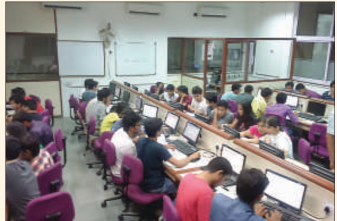
TI Analog Design Contest at IT-NU