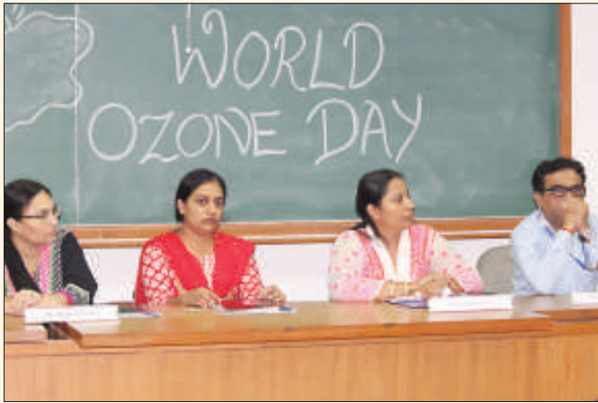
Ozone Week Celebration at IL-NU

Flagship Events were Barn Dance, War of Bands, War of DJ's and Fashion Fiesta. Model Indian Parliament 'Pratinidhitva' was also the highlight of the event.