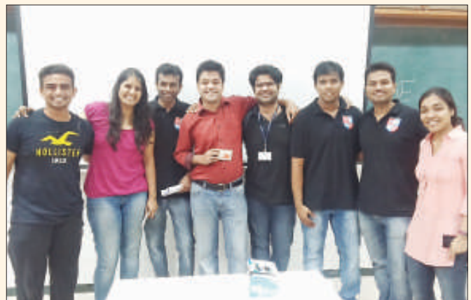
The participants of the Da Vinci Code at IM-NU

'The Da Vinci Code', a fun event was organized by Club Sumantra of IM-NU on October 28, 2015. Twenty teams comprising two members each, participated in the event. The event had two rounds including a Crossword Puzzle and an Audio Round. The Crossword Puzzle consisted of clues related to books and movies which are adaptation of books. For the Audio Round back-ground music and dialogues of famous movies were played. The participants had to recognize the movie and name the book on which the movie is based.