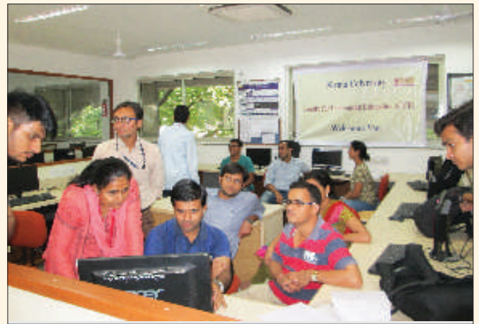
Two Days Training Programme on Testing and Verification of VLSI Design conducted by IT-NU during October 10-11, 2015