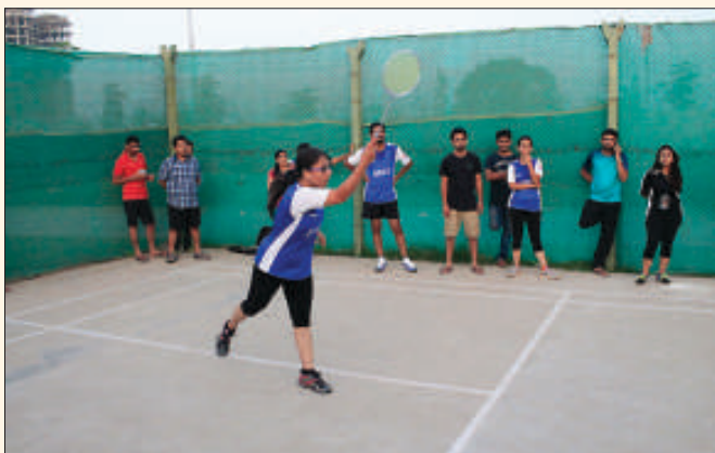
The Badminton Match in progress during Parakram at IM-NU

The National Level Sports Event is organized annually with the aim to provide opportunity to the students of B-Schools to showcase their sports talent and also to provide a platform to meet, learn and interact with each other. This time Parakram-2015 was associated with 'Navjyot Andhjan Mandal' for the noble cause of betterment of blind people. The event saw participation of over 240 students from various colleges of the country. The event was scheduled during October 9-11, 2015 at IM-NU.