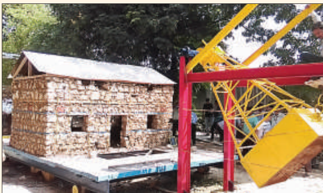
The Shock Table Test at IT-NU