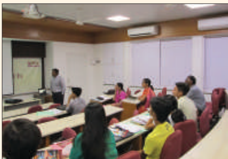
Two Days Workshop on Dynamic Web Designing using Angular JS conducted by IT-NU during October 10-17, 2015