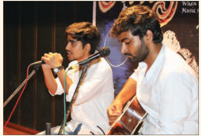
Spirited performance in progress during 'Tangerine' at IL-NU