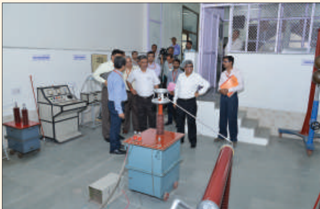
NAAC Peer Team Members during the visit to the Institutes and the University

The results of the accreditation were approved by the NAAC Standing Committee in its meeting held on November 15, 2015. The committee has recommended 'A' Grade for the University.