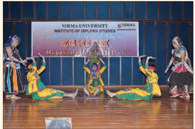
The students performing at IDS-NU

IDS-NU celebrated its Cultural Festival 'Zenith- 2015' during September 21-22, 2015. The students actively participated in various competitions organized during the festival.