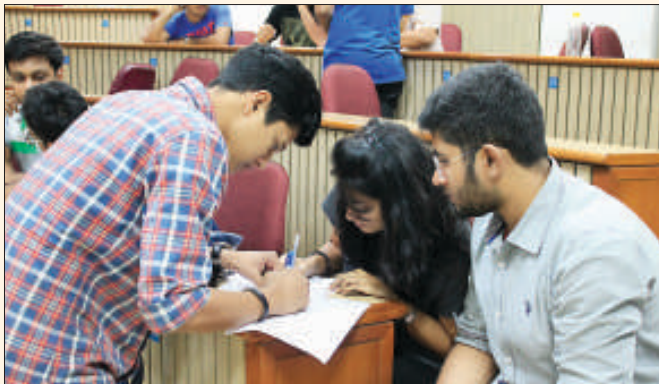
The students strategizing during 'Ahavan' at IM-NU

The event was organized by 'Konkurrence'- the B-School Competition Club of IM-NU on October 26, 2015. The event included rounds of extempore and dumb charades amongst the teams comprising three members each.