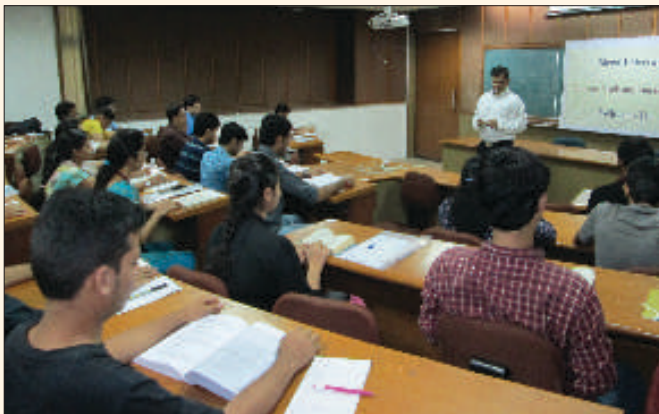
One Day Workshop on Readography on September 19, 2015