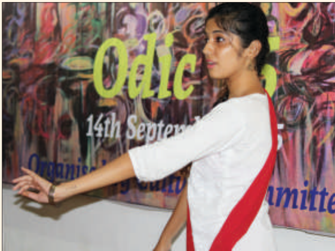
A student performing during Odic' 15

Odic'15, the first ever initiative at IL-NU to celebrate Hindi Diwas on September 14, 2015 was a huge success in its own way. The cultural committee of the Institute organized various activities related to the expression of the Indian Culture. The students were dressed up in traditional attires. Classical performances, recitation of literature in Hindi by the faculty members and the students were the star moments of the celebration.