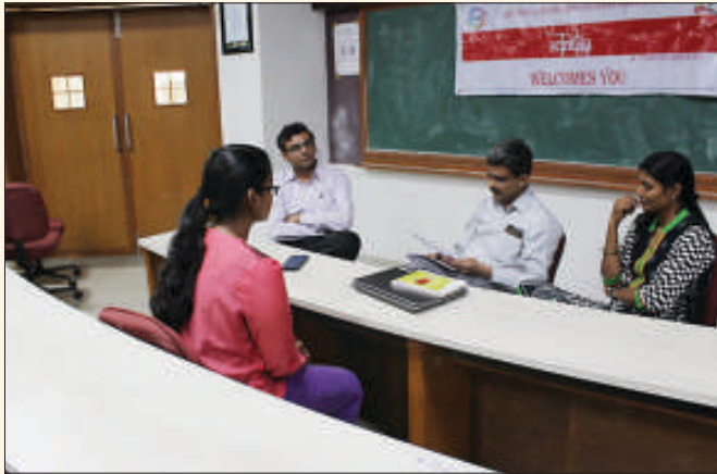
The Final Round of Mock Placement during 'Scintilla'

state. This event had 298 participants out of which 107 participants were from different colleges.