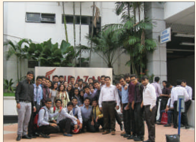
The students of IM-NU at Kaula Lumpur, Malaysia