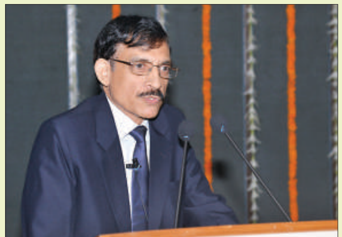
Padmashri Dr Avinash Chander, renowned Indian Scientist and Scientific Adviser to the Defense Minister, Government of India visited IT-NU during NUiCONE and delivered the keynote address during the inaugural function of the conference on November 26, 2015.