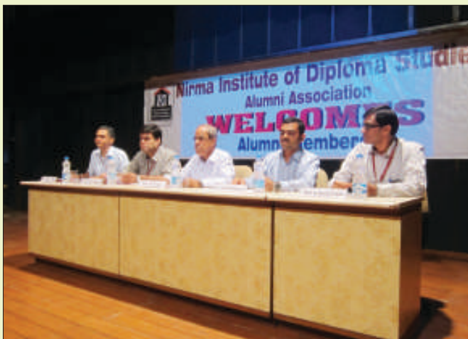
Dignitaries on the dais during the AGM meeting of NIDSAA at IDS-NU

The Annual General Meeting (AGM) of NIDSAA (Nirma Institute of Diploma Studies Alumni Association) was organized on October 3, 2015. Eighty Alumni members attended the event.