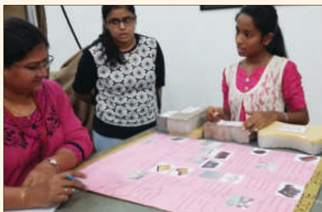
The students explaining their chart during the exhibition at IT-NU

An Exhibition cum competition related to the course of Building Construction and Materials was held on October 21, 2015 at IT-NU. The students displayed poster/charts along with actual samples for various topics related to the theme.