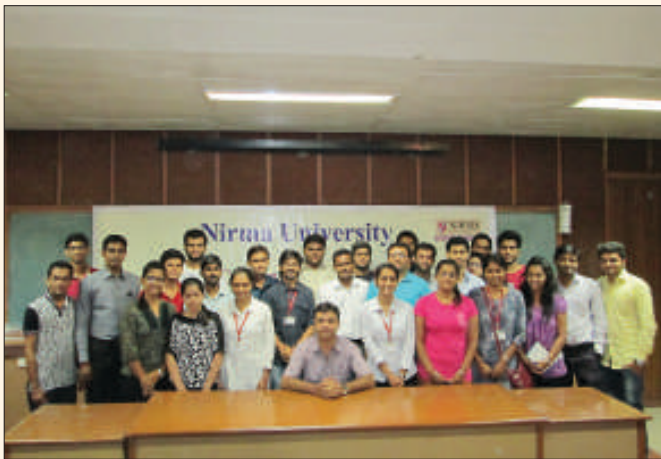
Two Days Training Programme on Energy Efficiency of Process Utilities conducted by IT-NU during October 10-11, 2015