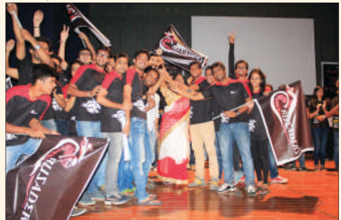
The ecstatic winners of 'Rannbhoomi'

Niche, the Marketing Club of IM-NU organized the event on October 20, 2015. The event was an inter class competition in which each class came up with a video, banner, flag, slogans, jingle, dance, songs, skit or anything that they could think of, to brand itself.