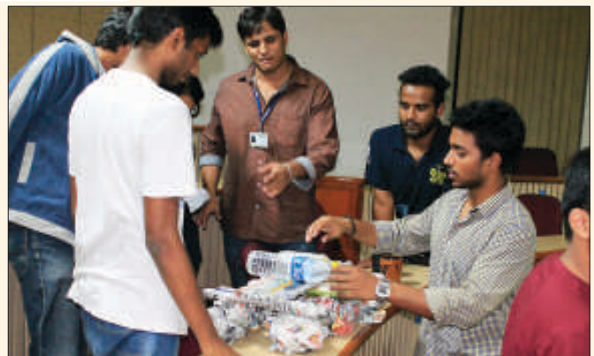
The students participating in the event 'Roomies' at IM-NU

On October 29 2015, Expressions, the Fun Club of IM-NU organized their third calendar event of the year – Roomies.