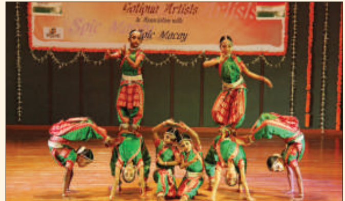
Gotipua Artists performing at IM-NU

originally from Odisha. The performance was carried out by young boys from Konark Natya Mandap dressed as girls in praise of Lord Jagannath and Krishna.